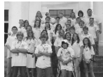
Global Youth Camp

Thank You for everyone who prayed for our students while at camp this year. 32 students and Adults attended camp this year. We already have 40 spots reserved for next year. Some of our results from this year: 5 Salvation's and 8 Renewal's. Praise God for what He is doing in the lives of our students.